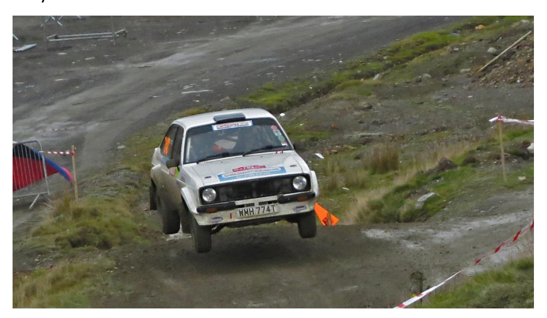
Flying high on the Sweet Lamb Stage

During the last 6 years I have been lucky enough to have had the opportunity to have had entered each of the last six events with mixed results of 4 finishes out of 6 starts can't be bad, in our 1978 Modern Historic Mk2, Ford Escort RS2000. The Car Spares Comma Oil supported Escort had one of our best results last year with 25 overall in the National Rally.