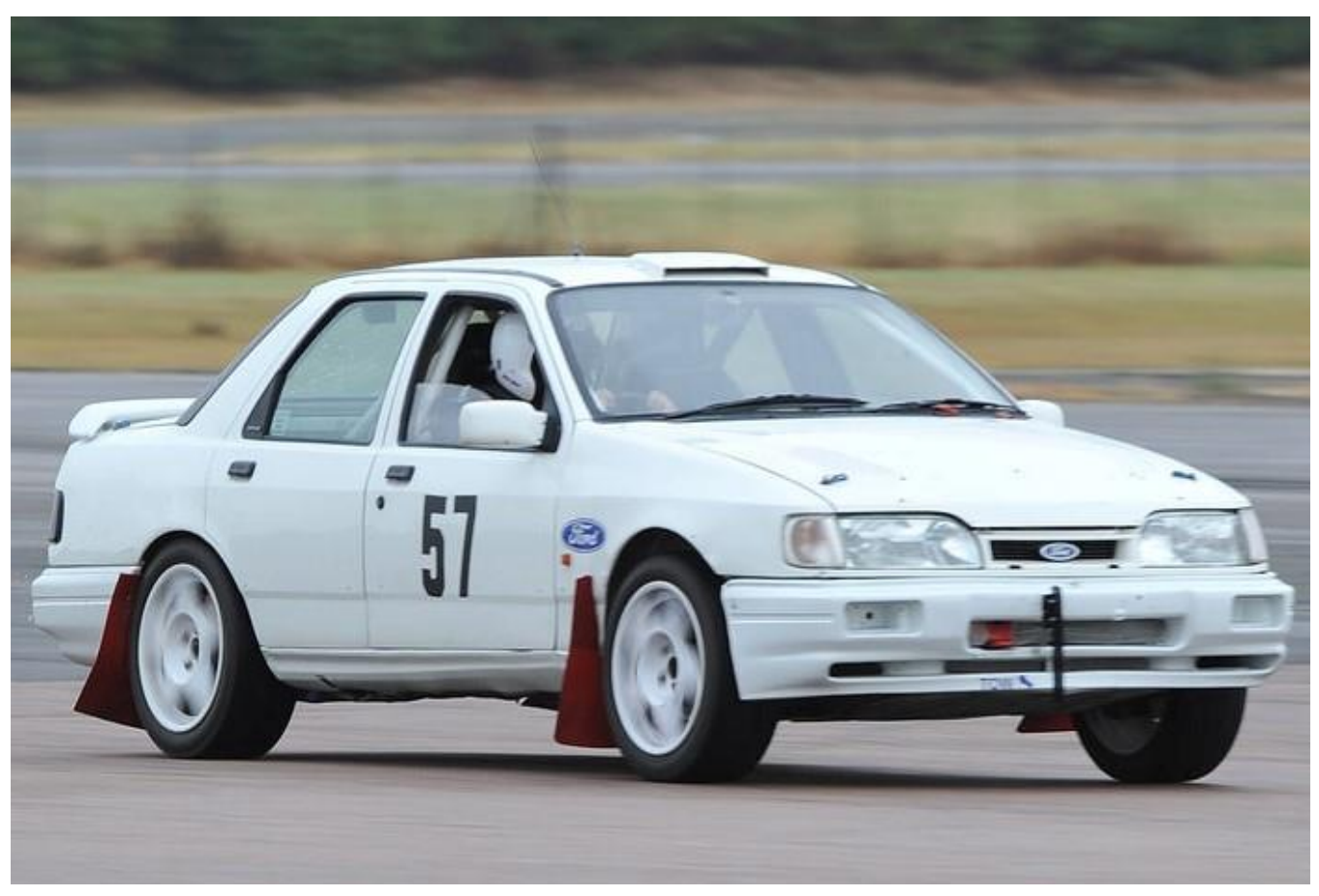
WAYFARER SEPTEMBER 2018